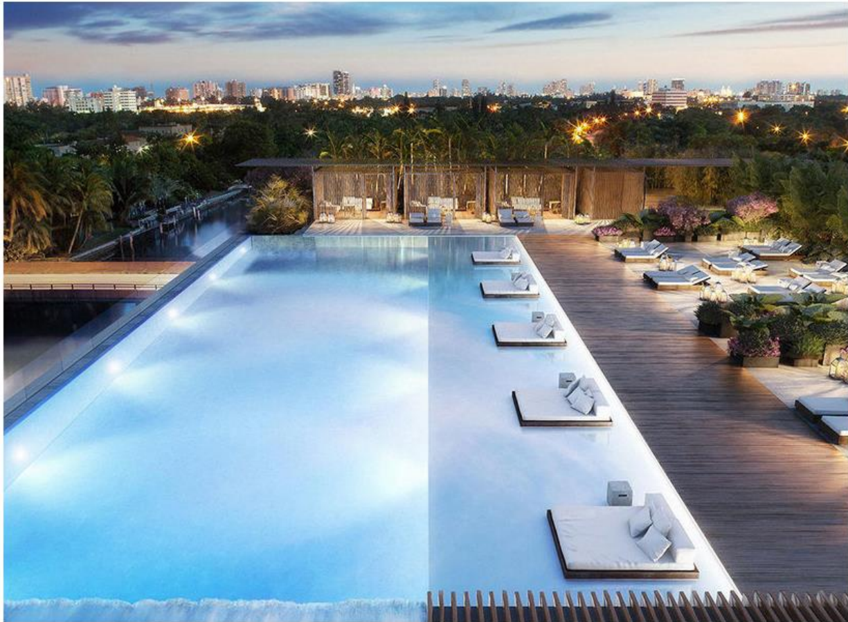
The rooftop pool lounge at The Ritz-Carlton Residences Miami Beach. THERESIDENCESMIAMIBEACH.COM

In recent years, developers around the world have been allotting increasingly more square footage to amenity spaces.