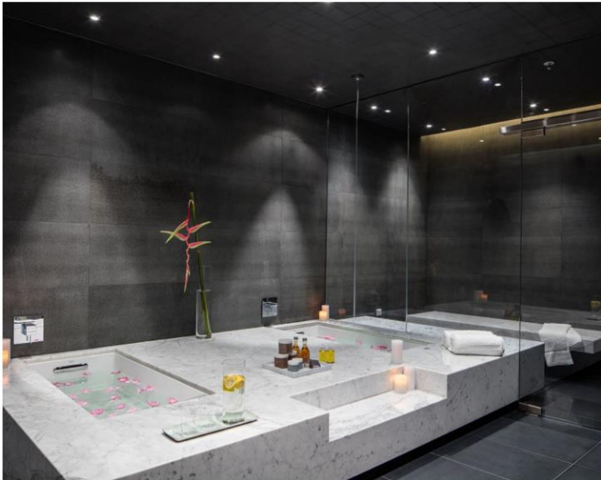
The hammam spa at Brickell City Centre.

At Brickell City Centre , a mixed-use development in Miami that recently opened, the hammam is made of marble and blush hammered black stone.