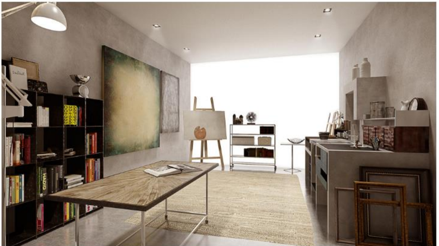
The Ritz-Carlton Residences Miami Beach residential artist studio

The Ritz-Carlton Residences Miami Beach , opening in 2017, features the world’s first residential art studio, with easels for painting, wall space for canvases, stone for sculpting, and tables for making jewelry and crafts.