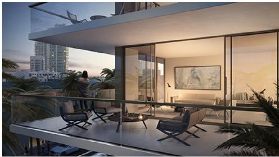
The living room leads out to a terrace

Additional perks include a 75-foot private rooftop pool, a hot tub and a fitness center. Inside the homes, each residence is equipped with a built-in espresso machine, fully integrated dishwasher, undercounter wine storage by Miele and European-style bathrooms. And the kitchens are custom-designed by Juul-Hansen.